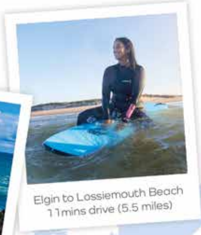
Elgin to Lossiemouth Beach 11mins drive (5.5 miles)