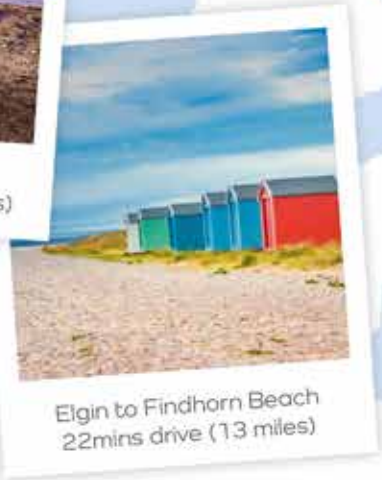
Elgin to Findhorn Beach 22mins drive (13 miles)