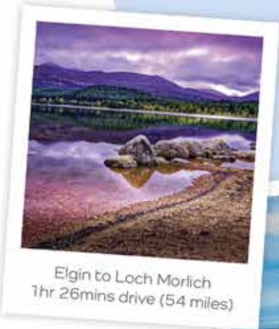
Elgin to Loch Morlich 1hr 26mins drive (54 miles)