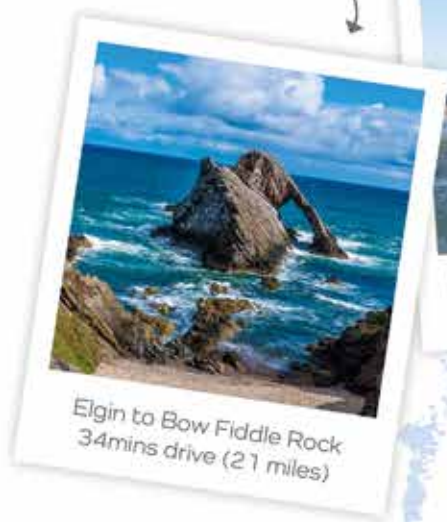
Elgin to Bow Fiddle Rock 34mins drive (21 miles)

Location for the final episode of BBC's The Traitors, Season 2.